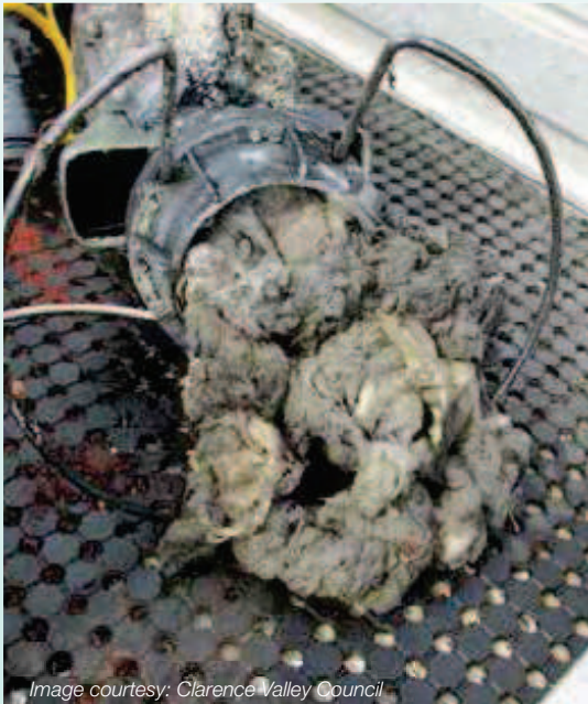
water system include nappy wipes, cleansing wipes, nappies, colostomy bags, cotton wool, make-up pads, cotton buds, dental floss, sanitary items, condoms and even plastic toys. These can cause havoc with our waste water system. All these items should be put in the general

These products block pipes and get caught in the equipment at our waste water treatment plants and pump stations that service your home and those of your neighbours. These breakdowns also add to Council's operating costs.